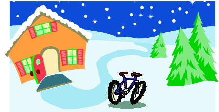
Too Cold to Ride!!!

Next Meeting at Grand Valley Inn FEBRUARY 10, 2015