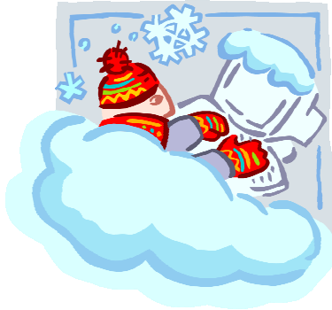
Valley Chapter Hog Newsletter