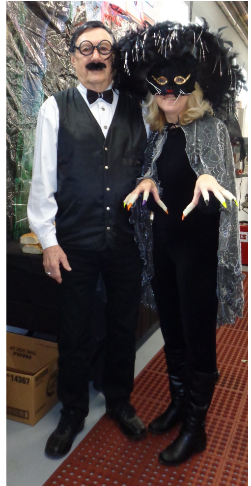
Can you guess who this couple is?